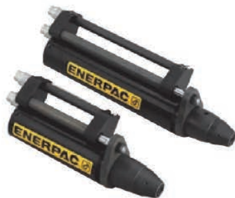
Tensioning Cylinders & Pumps