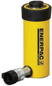
Single Acting Cylinders