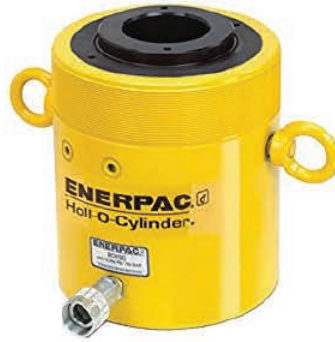
Hollow Core Cylinders