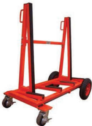
A – Frame Trolleys