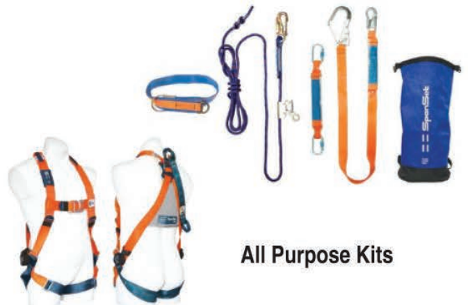
All Purpose Kits