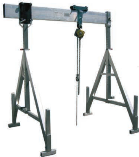
Gantries 1T to 1000T Capacity