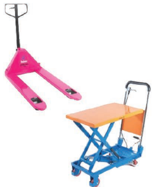
Scissor Trolleys & Pallet Trucks