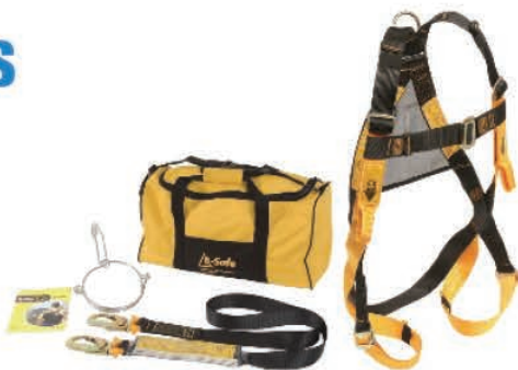
Height Safety Kits