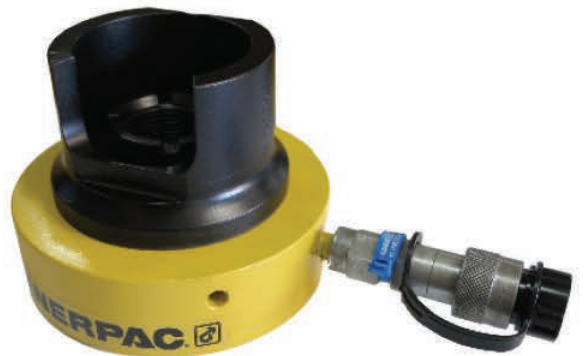
After: Refurbished, load tested cylinder.