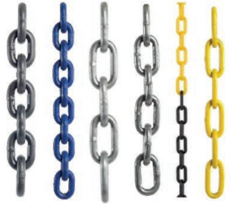
A variety of lifting lashing & plastic chains