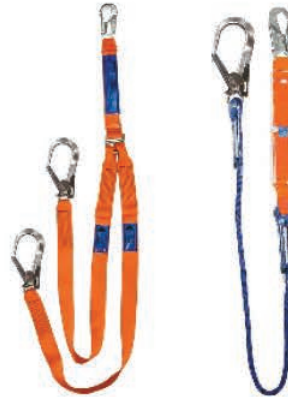
Lanyards & Shock Absorbers