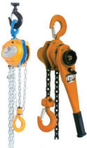
Chains & Lever Blocks