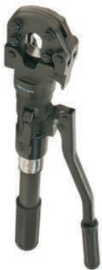
Wire Rope Cutters