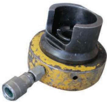
Before: Damaged, leaking cylinder.