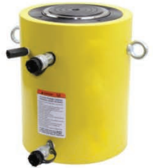
High Tonnage Cylinders