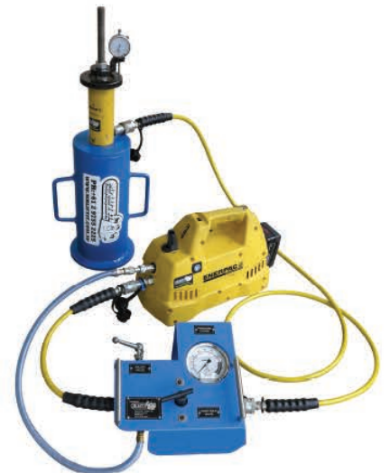
Portable Anchor Point Tester