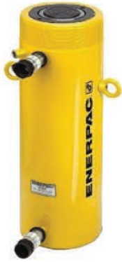
Double Acting Cylinders