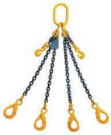
Multi Leg Chain Slings