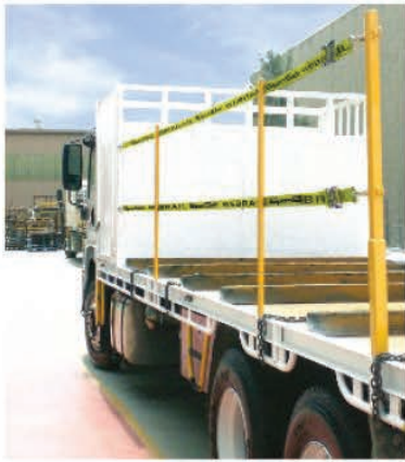
WebRail Truck Fall Protection